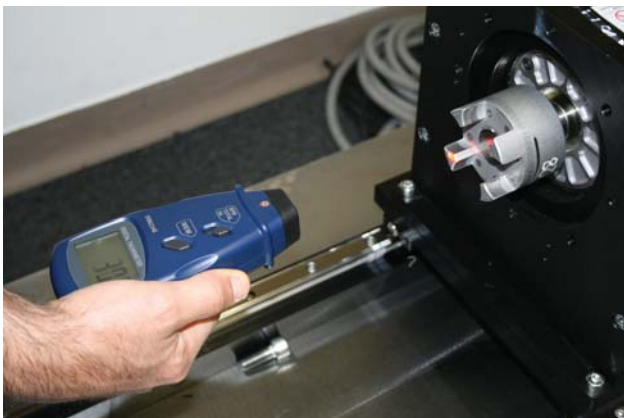
PT-110 recording rotational speed of machinery.