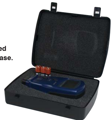
PT-120 with included protective carrying case.