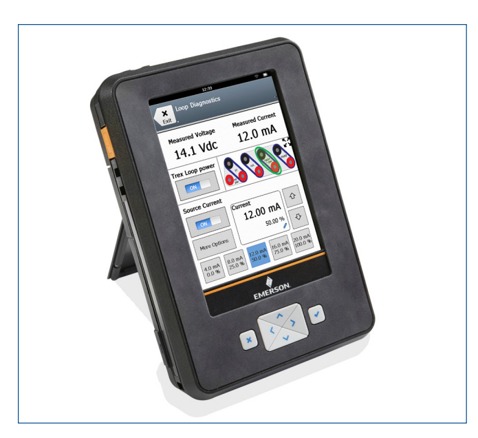
The rugged form factor is built for an industrial environment.