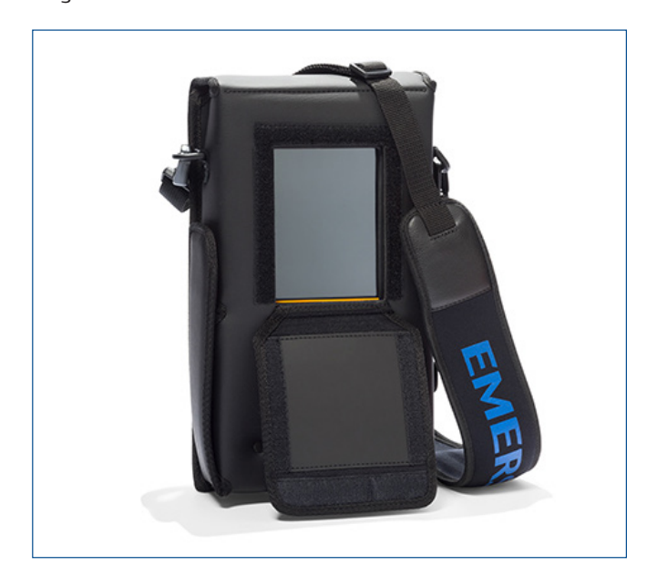
The useful carrying case protects your Trex unit in the field and provides storage options for accessory items.

Using the ValveLink Mobile app on the Trex unit, you can perform valve diagnostics in the field, including valve signature, dynamic error band, PD one button sweep, and step response, without having to pull the valve or perform invasive troubleshooting steps. ValveLink Mobile works with HART and FOUNDATION Fieldbus Fisher® FIELDVUE™ digital valve controllers and provides an intuitive user interface that is easy to understand and use. The large touchscreen on the Trex communicator makes it easier than ever to see all valve diagnostic details.