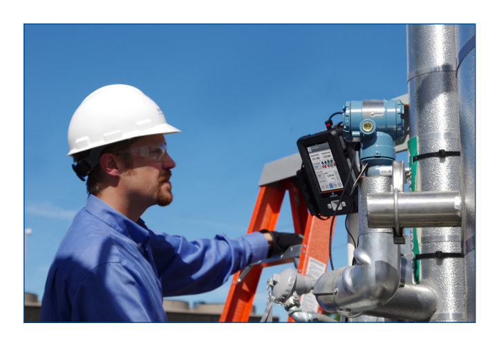
The magnetic hanger accessory allows you to attach the Trex unit to a pipe, freeing up your hands for other work.

You can also verify whether the DC voltage is correct in HART loops.