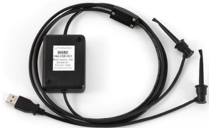
51HMUSB04A shown above with minigrabbers